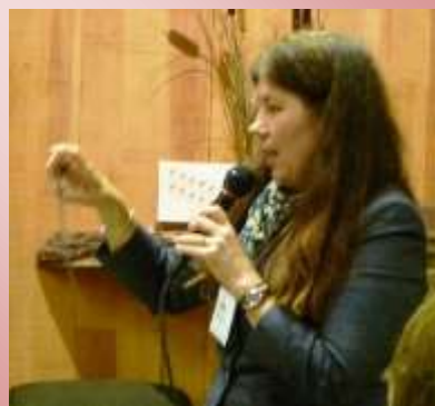
Holly brought button inspiration.