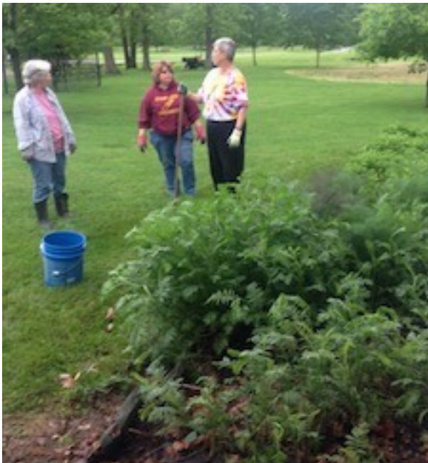
Working hard this month in the Dye Garden at Mill Hollow.