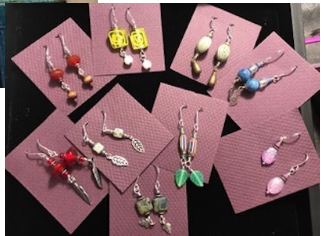
A rainbow of earrings. I made 100 pairs of earrings.