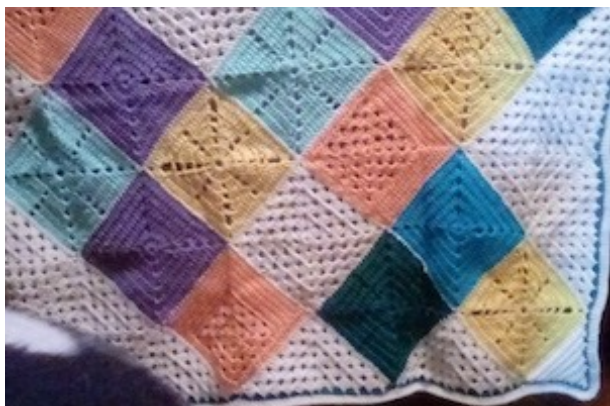
This is a granny square baby blanket, with multiple types of granny squares. Missy M.