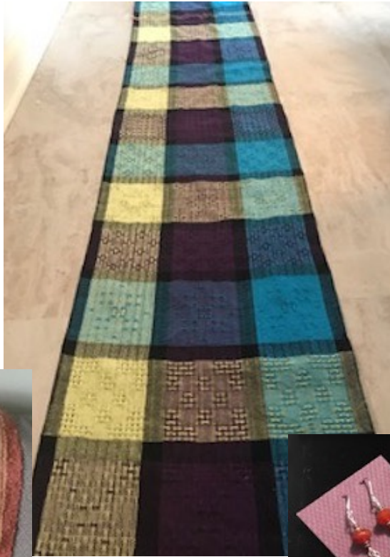
Huck Lace runner for kitchen table.