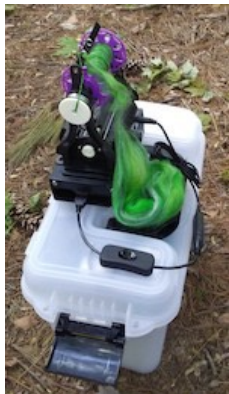
Spinning while camping! Great vacation/distancing. Missy M.