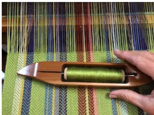
Action on the "pansy inspired" tencel scarf. Betsy