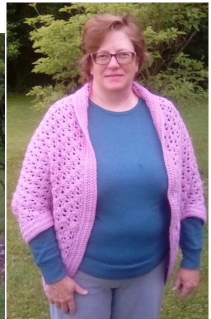
This is an "Erin" cocoon shrug. It is from leisure arts, they put out a monthly pattern. I am thinking of a tan or brown one next. Miss everyone! Missy