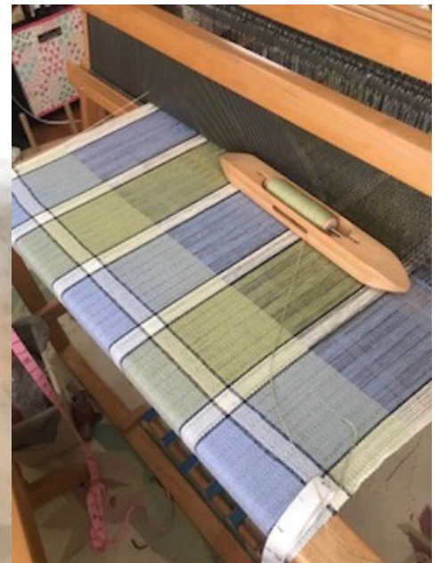
Cotton Towels still on the loom.