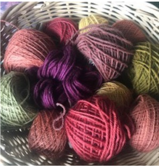
The basket has all the dyed yarn for a throw blanket project. All natural dyes. The blanket finished and displayed in my living room.