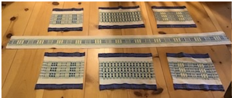
Here are the latest 2 projects. Turned Monksbelt. Log Cabin Debbie S.