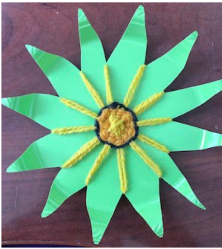
Funflower: Disposable plate and Harrisville Highland Wool