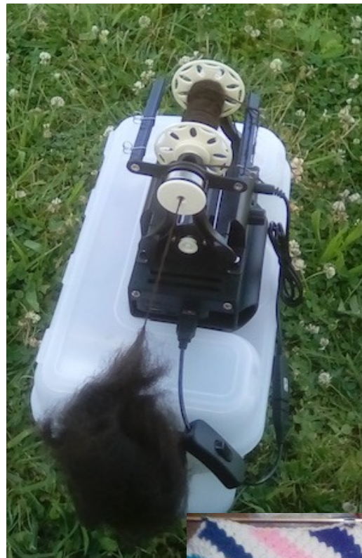
Spinning at East Harbor enjoying the lake too! -Missy