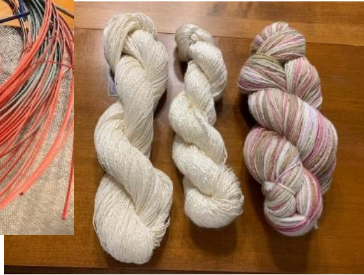
TDF 2020 Spinning