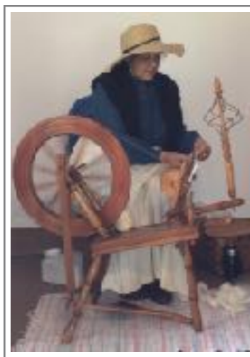
LOCO Member demonstrates the use of a spinning wheel.

The Guild Newsletter, published monthly, includes a calendar of events, current news, items for sale, photos of programs and workshops as well as other information of interest to members. It is also available electronically at locoguild.com .