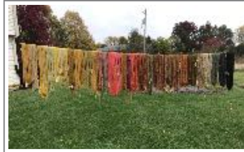
Nature's Pallet workshop on Natural Dyes

Prominent experts present programs and workshops to further the study of spinning and weaving techniques and other fiber-related crafts. Members share their knowledge at "LOCO Lessons" which are short programs prior to meetings.