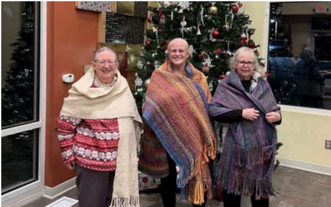
Shawl drawing winners for 2025